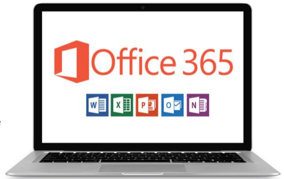
Laptop or Desktop Computer Edition